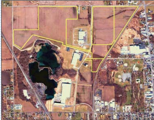
Marion Dual Rail Industrial Park