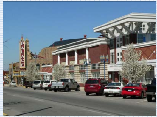
Marion County Building & Palace Theater